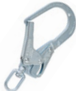
Scaffoldhook with Swivel Opening - 63 mm