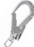
Scaffoldhook with Swivel Opening - 63 mm