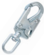
Snaphook with Swivel Opening - 19 mm