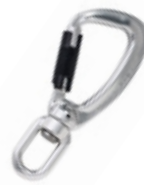
Triple Action Twistlock with Swivel Opening - 22 mm