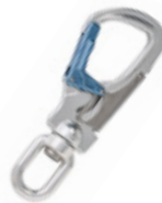
Snaphook with Swivel Opening - 19 mm