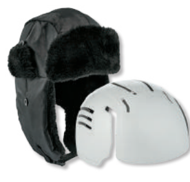
6802 71 ZIPPERED TRAPPER HAT + BUMP CAP INSERT Item# 16897 Item# 16899 🛝

8960 LED - SHORT BRIM - LIME Item# 23377