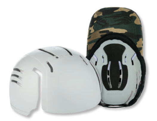
8945 UNIVERSAL BUMP CAP INSERT Item# 23380