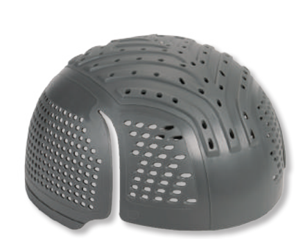
8945F(X) UNIVERSAL BUMP CAP INSERT WITH EXTRA VENTING Item# 23481