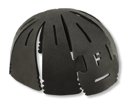
8944 SOFT FOAM BUMP CAP INSERT Item# 23410