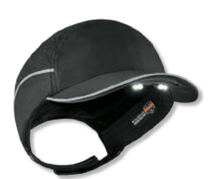
8965 LIGHTWEIGHT LED -SHORT BRIM - BLACK Item# 23368