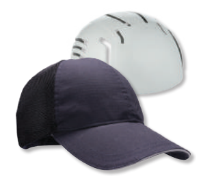
8946 STANDARD BASEBALL CAP - NAVY + BUMP CAP INSERT Item# 23403

8960 LED - LONG BRIM - BLACK Item# 23374