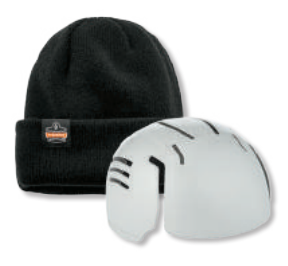
6811 zı ZIPPERED RIB KNIT BEANIE + BUMP CAP INSERT Item# 16811