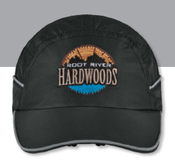
CUSTOMIZE YOUR CAP. We can put your logo on your bump cap for a look that's all your own.