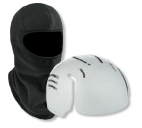
6893 71 ZIPPERED BALACLAVA + BUMP CAP INSERT Item# 16893

8960 LED - SHORT BRIM - NAVY Item# 23373