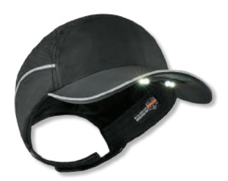
8965 LIGHTWEIGHT LED -LONG BRIM - BLACK Item# 23369